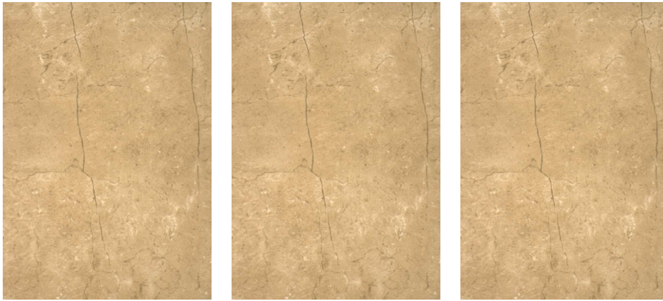
Figure 2: Example ceramic surfaces with three different chromatic tonalities (images from the authors of [75]).

primitive representation and associated displacement rules, there are relatively limited works using structural approaches (cf. Table 1).